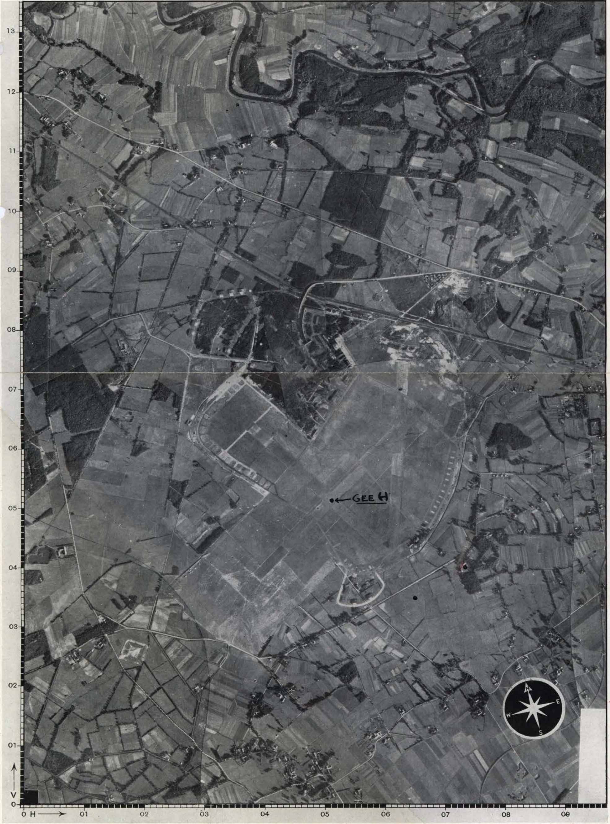
Illustration No. 3/AIR/214/3