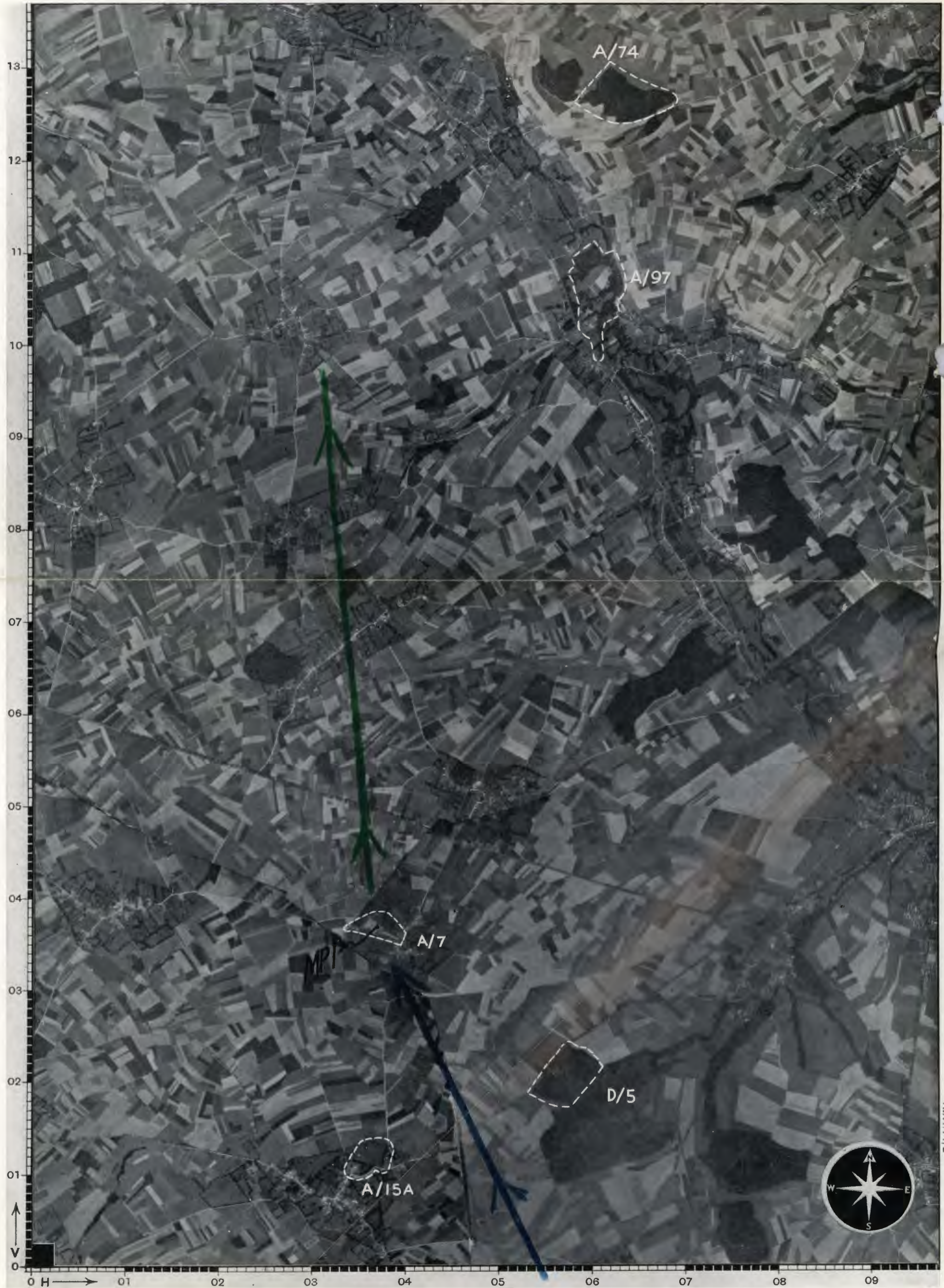
Illustration No. XI/A/7/1 XI/A/15A/2 XI/A/74/2 XI/A/97/1 XI/D/5/1