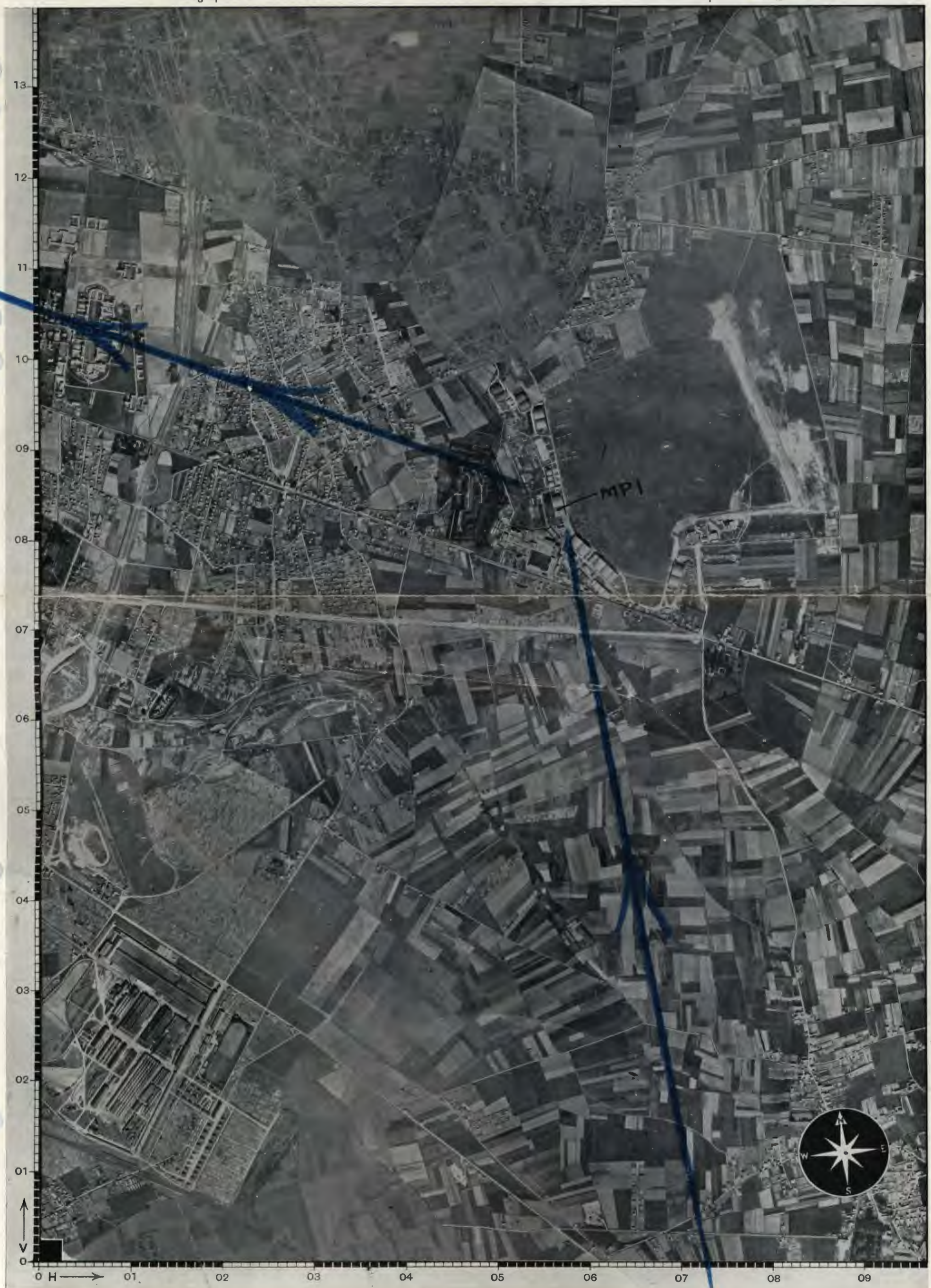
Illustration No. S. 5677/1